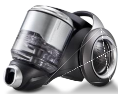
Smooth Motion Big & hollow wheels