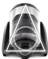
Stable Motion Cambered wheels