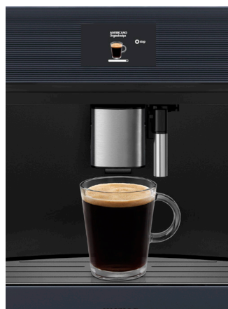
Height adjustable coffee spout