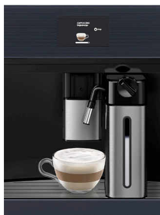
Thermal milk jug