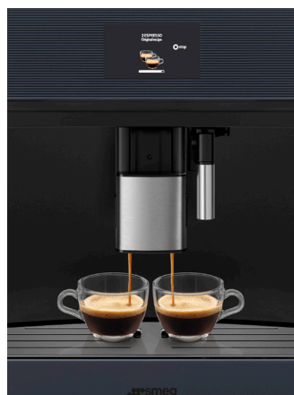
2 x Espresso in one cycle