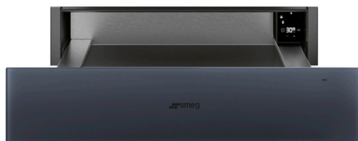
CPRT115G LINEA WARMING DRAWER