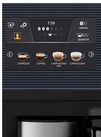
13 coffee options