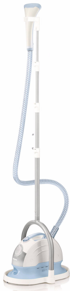
Philips QuickTouch Garment Steamer