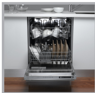
OPEN door view