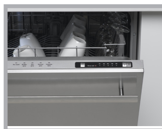
All controls located on top of door including digital display

Easy adjustable top basket even when fully laden