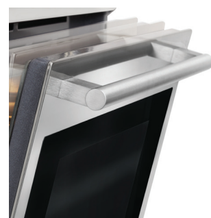
S-move soft & gentle closing door hinges