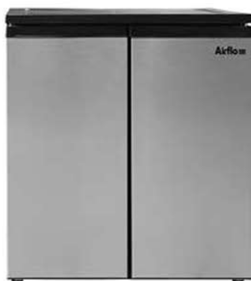
Fridge and Freezer Combo Model no. AFF156